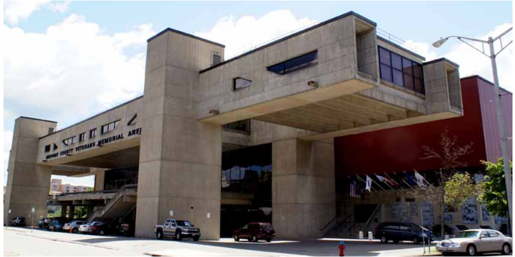
The Veterans Memorial Arena housed the 93rd Department Convention.