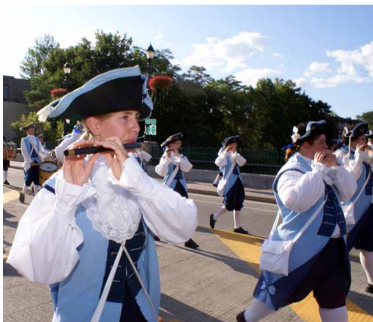
The Tonawanda Post 264 Senior Band and the Towpath Volunteers took first place ribbons in the Convention Parade.