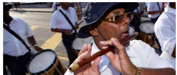
Yankee Doodle Band from Rensselaer (top) and Yonkers Fife and Drum Corps were crowd-pleasers.