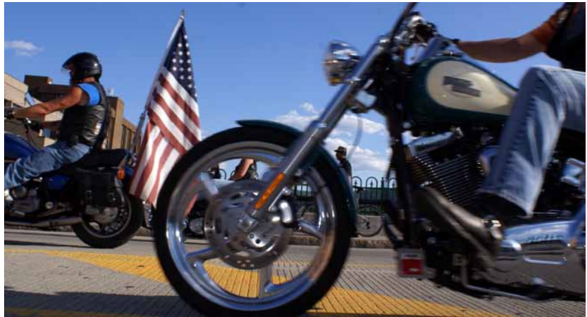
Rumbling roar of bikes signaled the parade's start as Legion Riders led the way.