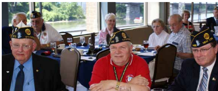
A few of the faces at the NYALPA awards luncheon and business meeting. More photos, Page 11.