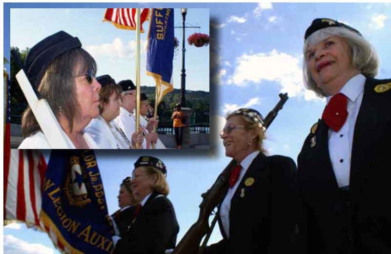
Auxiliary marching units populated the parade.