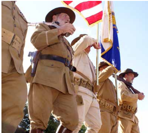
The World War I era Doughboys.